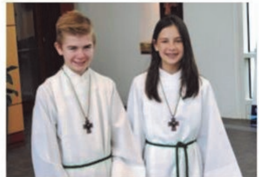
Back to School Family Mass