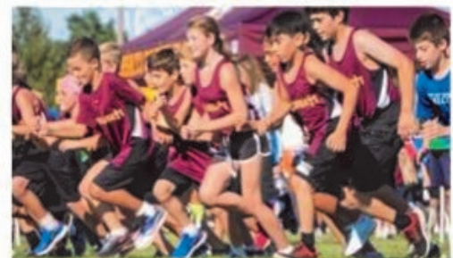
Cross Country Meet

Frassati Catholic Academy Preschool 3 through 8th Grade For more information call 847-526-6311 or visit www.frassaticatholicacademy.org .