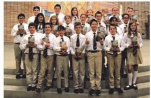
6th Grade Bible Mass